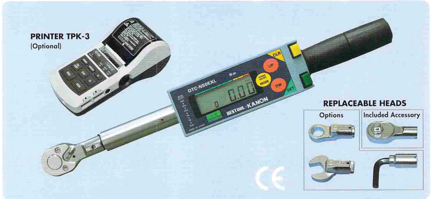
PRINTER TPK-3 (Optional)

Newly designed, features a multi-function digital read-out.